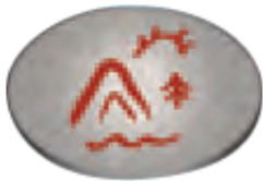
ǀwseltknéws- Everything is interelated

We have a vision of a Secwépemc-speaking community living in balance with nature.