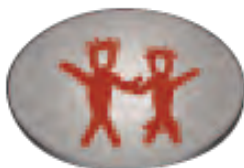
Knucwestsút.s- Help yourself